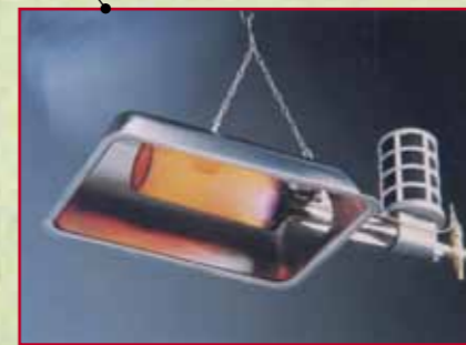
Heating systems like gas brooders particularly suitable for chicks during first days and air-blowers powered both by gas or diesel.