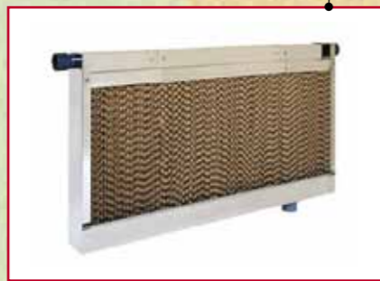
Cooling pad made in cellulose paper and stainless steel.