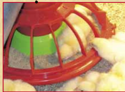
Feed pans for broilers, extremely resistant against cleaning products used in poultry farms.