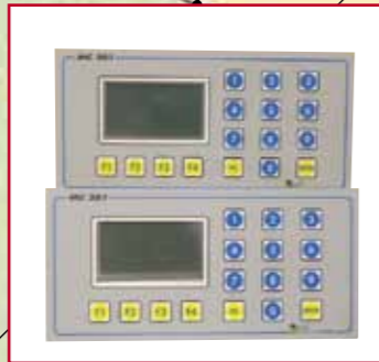
Computer to manage the feeding system, heating and ventilation.