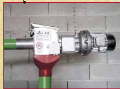
Drive unit complete with gear motor with one feed drop integrated.