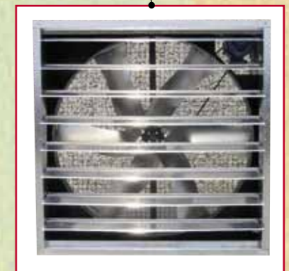
Fans manufactured in solid deep hot galvanised steel with blades in corrosion free aluminium. Different sizes and options are available.