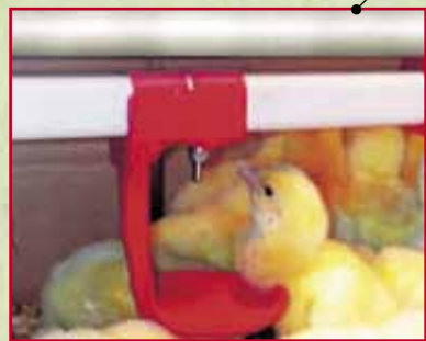
Drinking system with stainless steel nipple and drip-catcher.