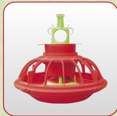
Broilers feed pan