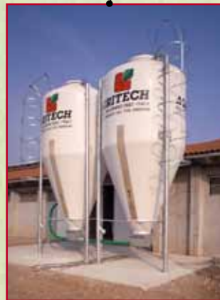
Fibreglass silos with automatic feed conveying system.