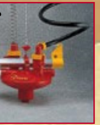
Pressure adjuster for nipple-drinking systems.