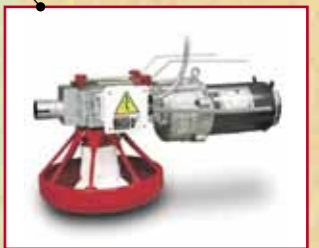
Stainless steel drive unit with gear motor.